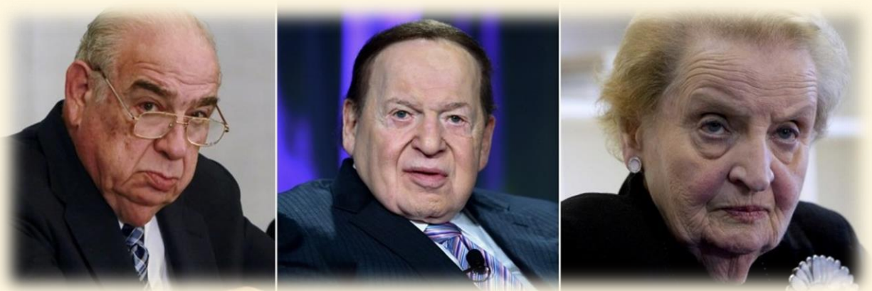
Sheldon Lavin; Sheldon Adelson; Madeleine Albright