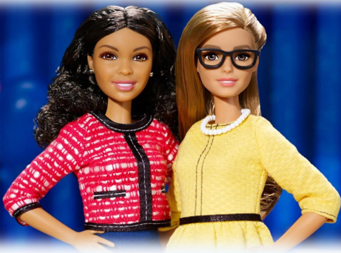
The 2016 edition of Barbie for President came with a female second-in-command.

The Barbie doll is a similar story, a product never intended for children. Barbie was a sex toy named Lili, created in Switzerland in the 1950s and popular primarily with perverted single men in Europe. A Jewish-American woman named Ruth Handler who, with her husband, owned the then-small company named Mattel toys, was on holiday in Germany and apparently fell in love with this doll, brought it to the US and began marketing it as a “more mature” companion for little girls “exploring womanhood”. Mothers were either disturbed or horrified, especially since Barbie’s “mature” body was “borderline pornographic” and seen as a serious danger “potentially damaging to young girls’ psyches”. That view is still held very strongly by millions of mothers all over the world who have banned this doll from their homes. But Handler, adopting Bernays’ propaganda methods, employed psychiatrists to learn how to change the values of American mothers in order to market this doll. The advice was to instruct mothers to consider Barbie as “a tool for teaching their daughters about the importance of appearance and femininity.” Just what every 3 year-old girl needed to help her grow up into a wholesome young woman – a plastic doll with big breasts and a sports car. I have always hated that doll.